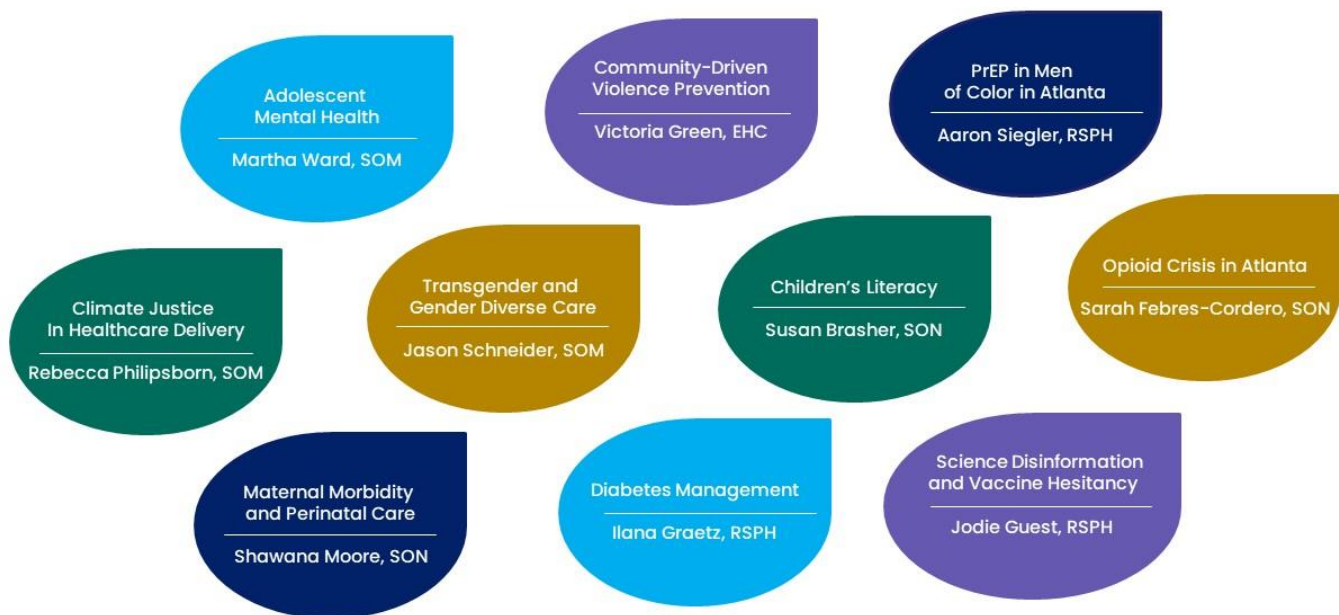
Figure 2: IPE-ACTS Health Challenges and Faculty Champions

After enrollment in November, students had until December 1, 2023 to rank the top 3 Health Challenges on which they would like to work. With this information, we assigned students to interprofessional teams and they will be asked to complete their IPE pre-test and didactic modules prior to IPE-ACTS Day on January 26, 2024. The online modules provide instruction in