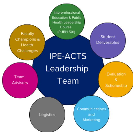
Figure 1: IPE-ACTS Leadership Team and Working Groups

The Office moved swiftly from concept to detailed framework for IPE-ACTS for a planned launch in fall 2023. To guide program development, we developed and led a Leadership Team that included educators from the schools of medicine, nursing, and public health. Members from the medical school included representatives from three of the six medical school degree programs (MD, DPT, and MMSc-PA). Each Leadership Team member served as the lead of one of the working groups (Figure 1), and the Office of IPECP's Advisory Committee has provided insightful perspectives on the program's content and delivery as we have refined program goals, curricular objectives, and activities.